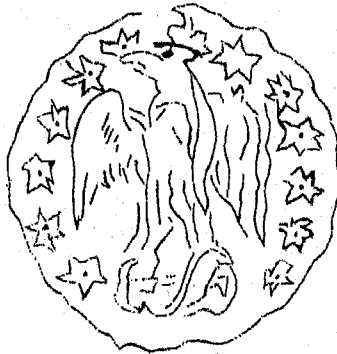
First Appearance of Eagle on an American Coin

Citing the strange circumstance that Uncle Sam has never extended legal protection to the emblem of his own National Independence, and at the same time, launching a campaign to secure such protection, the National Association of Audubon Societies says: "It is a strange and unaccountable fact that federal protection has never been accorded the American or Bald Eagle, which was adopted as our National Emblem by Act of the Continental Congress on June 20, 1782, and has been used throughout our history as our national seal, on coins, coats of arms, stamps and various emblems. If the question be raised, 'Why protect the Bald Eagle?' as well ask, 'Why protect our flag?' Both are symbolic of our sovereignty and our independence as a nation."